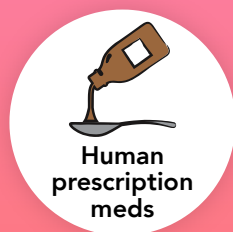
Human prescription meds